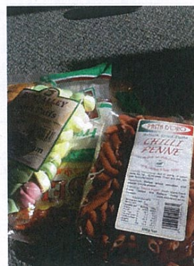
11. transparent plastic