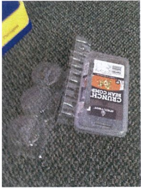
1. transparent flimsy plastic