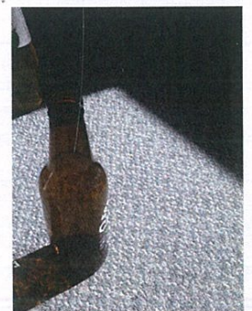
14. coloured glass