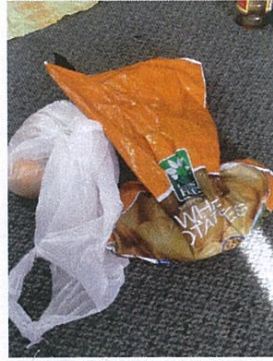
7. plastic bag