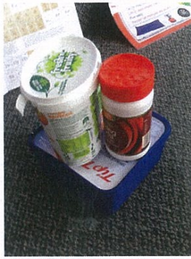
3. un-transparent hard plastic