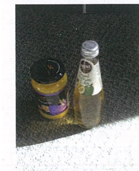
13. transparent glass