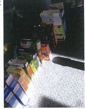
8. cardboard packets