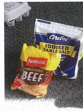
12. non-transparent plastic