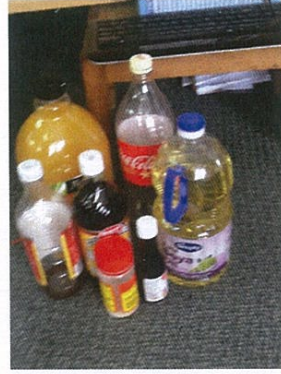
4. transparent hard plastic